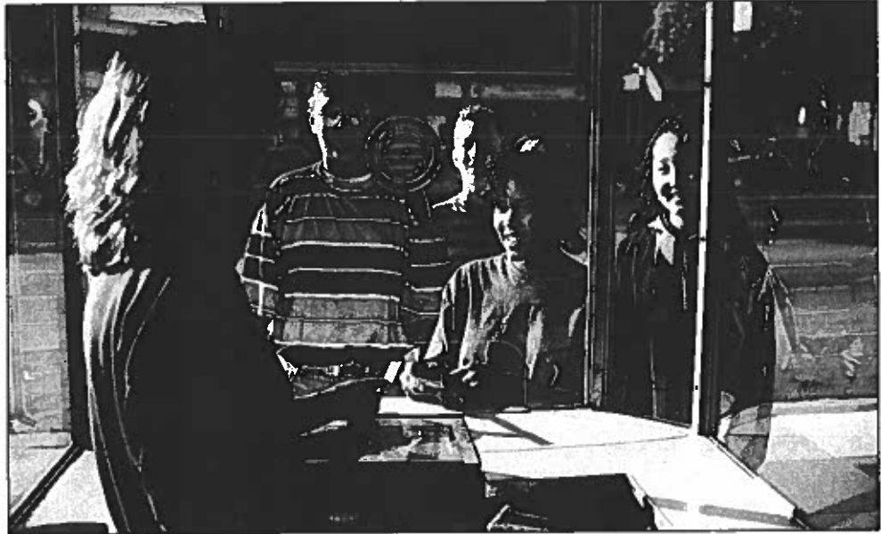
An agent sells a ticket to a customer.

Passenger Rate Clerk sells tickets, plans special or chartered trips, works with customers