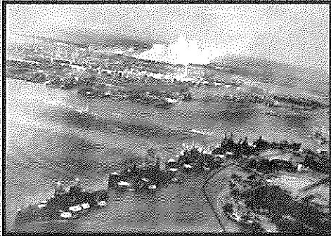
View of the attack on Pearl Harbor from a Japanese aircraft. The row of ships in the bottom center was called "Battleship Row." In this picture, some of the ships have already been hit by torpedoes and are beginning to sink. The lines in the water show the torpedo's path. The smoke in the background is from another ship that has been hit.