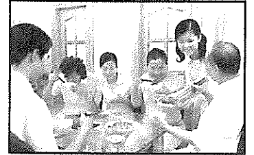
Earth is home to many different people.